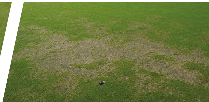
Advanced symptoms of nematodes in creeping bentgrass if left unchecked.