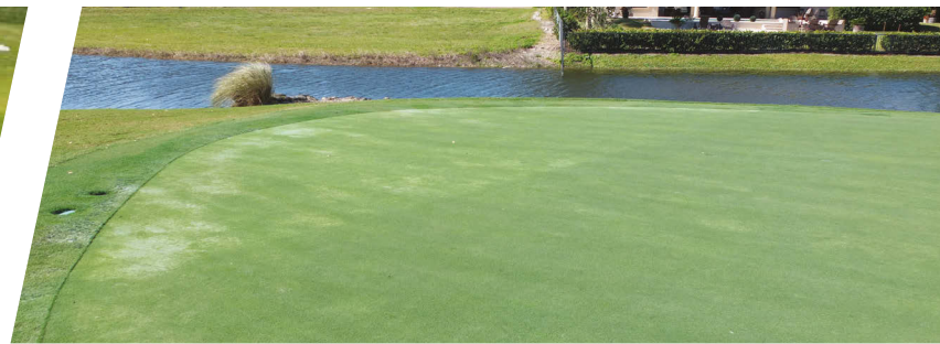
Damage from sting nematodes in untreated bermudagrass (top left) versus Indemnify-treated bermudagrass. (Bayer)