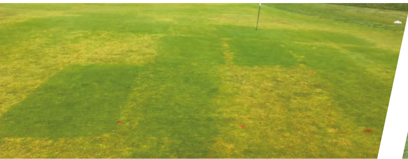
Anguina damage in untreated plots versus Indemnify-treated plots of annual bluegrass in California.